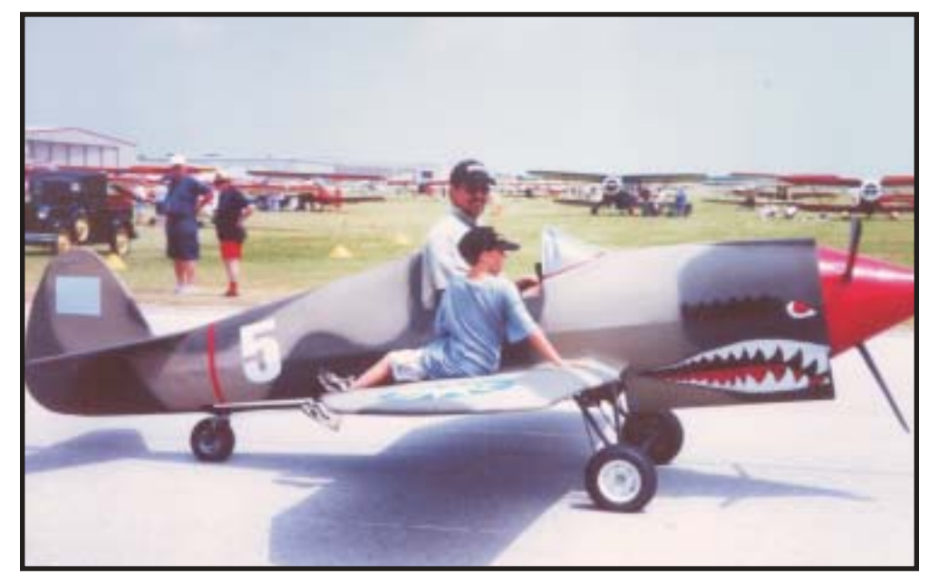
How do you think an aviation-minded kid would like this go-cart?

After several enjoyable hours immersed in antique, military, and general aviation aircraft and meeting fellow aviation enthusiasts, it was time to leave for home. The return flight was just as murky as the flight down, but the new aviation memories and a 30knot tailwind carried me home with a smile. Next year's meeting is scheduled for the first weekend in June and I plan to attend.