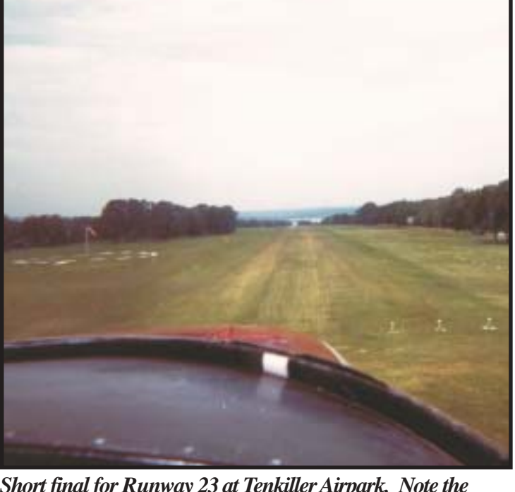
Short final for Runway 23 at Tenkiller Airpark. Note the sliver of lake visible at the end. As the saying goes, "If you lived here, you'd be home now." Hey, we really do!

in the cool weather of fall. Obviously we will continue to publish the Oklahoma Aviator each month as we have. But in addition, I intend to build and restore homebuilt, antique, and classic airplanes once again, an activity I loved for many years. And, with appropriate modesty, I can say that I'm pretty good at it. Over the years, my projects have consistently brought praise and won awards at fly-ins, including Oshkosh. If this sounds like shameless self-promotion, it probably is-- even living in paradise, we still gotta make a living! In fact, if you check elsewhere in this edition, you'll see and ad hawking my services. If you know anyone who wants high quality aircraft building or restoration, please send them my way!