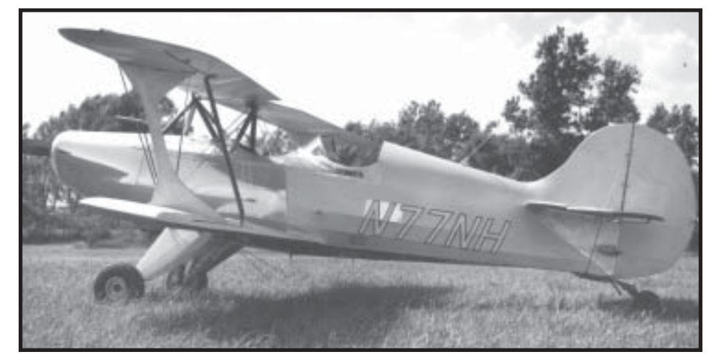
The Norton-Huffman Skybolt, as it looked shortly after first flight in 1976.

I think the Skybolt was my favorite of all the airplanes I've owned. Gee, I wish I had it back!